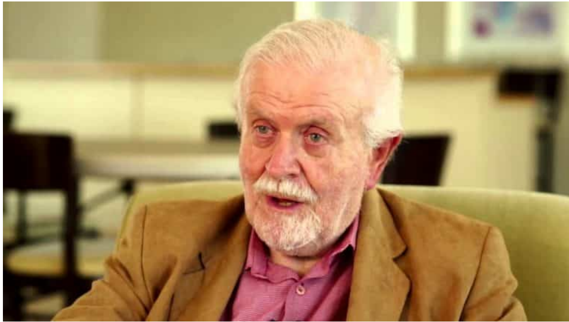
Dr. Fred Singer

Foremost in the struggle to bring essential scientific truths to light on this issue is the Nongovernmental International Panel on Climate Change (NIPCC) founded and directed by the distinguished atmospheric physicist S. Fred Singer. With assistance from climate experts in 16 countries—who donated their time and efforts—the NIPCC produced a massive, extensively-illustrated 880-page report “out of concern that the IPCC was provoking irrational fear of anthropogenic global warming,” in the words of Dr. Singer. The report references 4,000 (!) research papers in peer-reviewed scientific journals that contradict IPCC conclusions but were not used by the IPCC though it claims to be the definitive source of climate research. The entire report can be downloaded free from the Heartland Institute website.